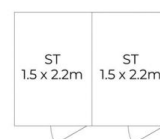
LEVEL B2 (NOT IN POSITION)